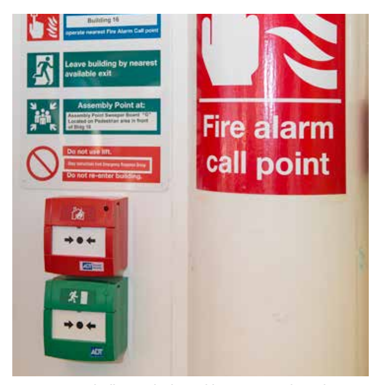
Figure 9: Manual call points for fire and for emergency door release

In addition some false alarms arise from accidentally trying to use an MCP to release an electronically locked door, rather than the normal control provided for this purpose, or the emergency override. An emergency override normally takes the form of a green fire alarm call point (see Figure 9). BS 7273-4<sup>[6]</sup> recommends that, where a green 'break glass' unit is likely to be used by persons other than trained staff, there should be a sign next to it saying, "In emergency, break glass to open door", to distinguish it from a fire alarm call point.