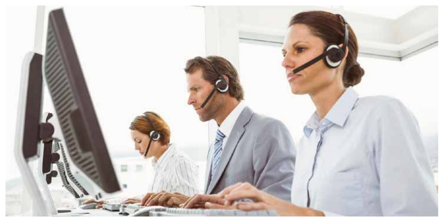
Figure 10 Alarm Receiving Centre

This false alarm cause had been observed during the previous BRE false alarm study, with BMKFA reporting 4.1% of false alarms (270/6612 incidents from June 2009 to April 2013) occurring because, "Somebody conducting weekly test of the system but not taking it off-line." This is a similar level to those reported in this study (6.5%- 426/6600), suggesting that this elementary breakdown in communication probably occurs throughout the UK.