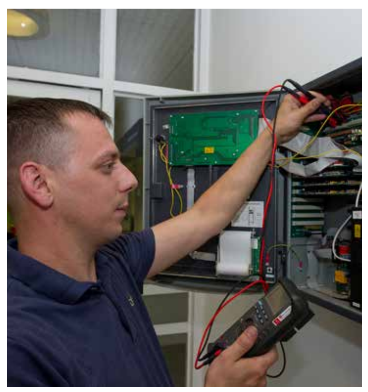
Figure 14: Panel maintenance in progress

Backed by anecdotal evidence, it was found that 28% of panels were indicating faults and 26% were isolated. This is a matter for concern and demonstrates that as many as 54% could have been outside of their expected operational state. The alarmingly high occurrence of this, whilst not part of the false alarms study, warrants further investigation as the parts of the FDFAS were potentially not operating as expected. It is recommended that guidance to end users is provided and guidance in BS 5839-1 for faults/isolations is enhanced, and that FRSs investigate these occurrences and review current operational procedures.