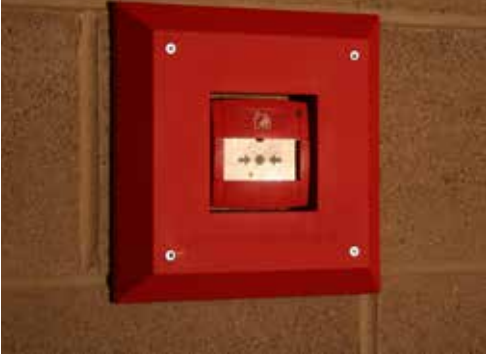
Figure 8: Protective shielding for manual call points

The product standard EN 54-11<sup>[5]</sup> has an impact test in which a chamfered hammer strikes the outer edges of the MCP, once from the side and once from the front, with impact energies of 1.9J. This is considered adequate for most applications and even though the impact energy from a trolley is much greater than this, there is no need to recommend higher levels in the standard as these are extreme applications and exposures that are not typical of most service environments.