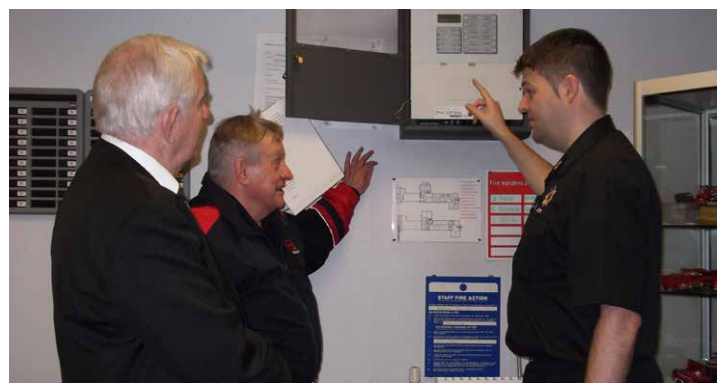
Figure 4: Fire Alarm Investigation