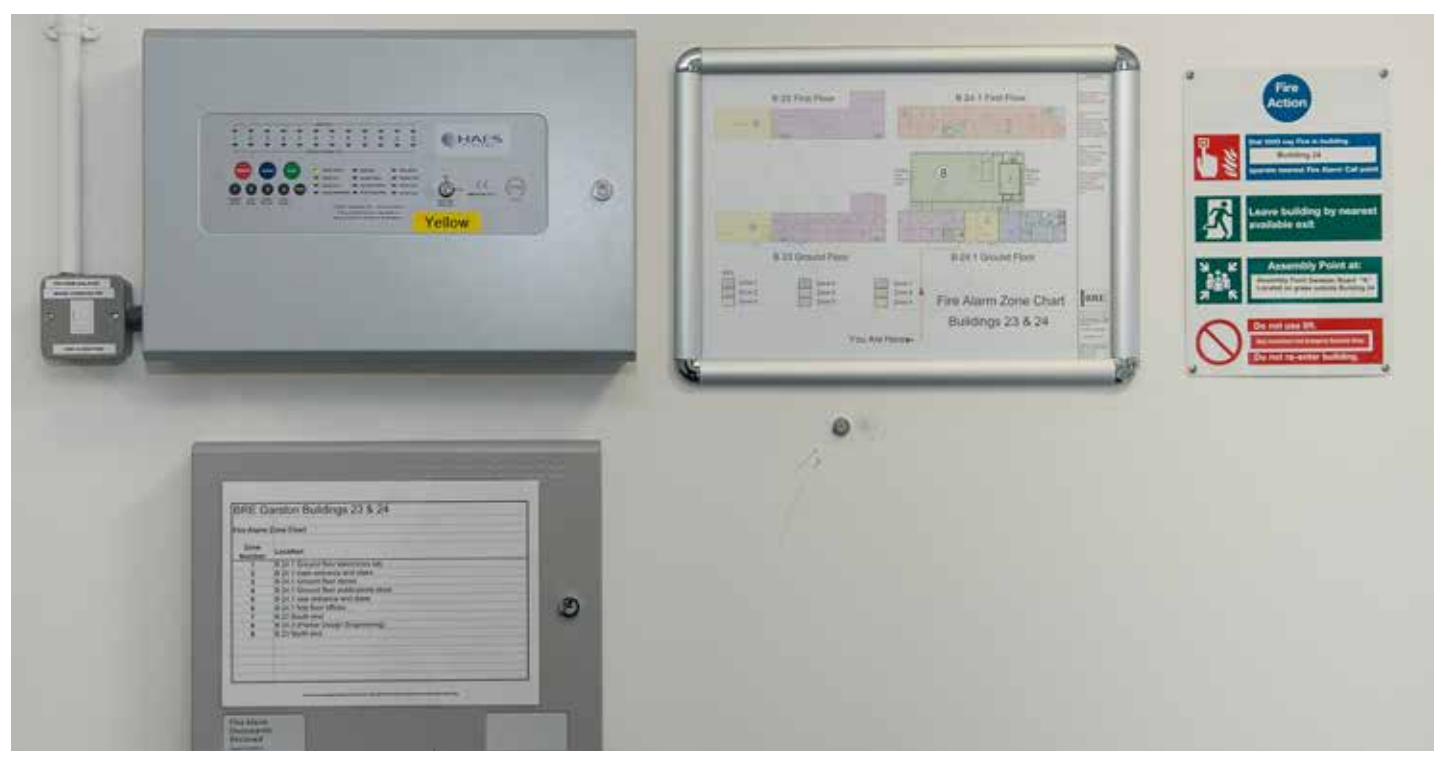
Figure 17: Good maintenance – the control panel is in quiescent mode (no faults or isolations), the logbook present and zone plan up-to-date