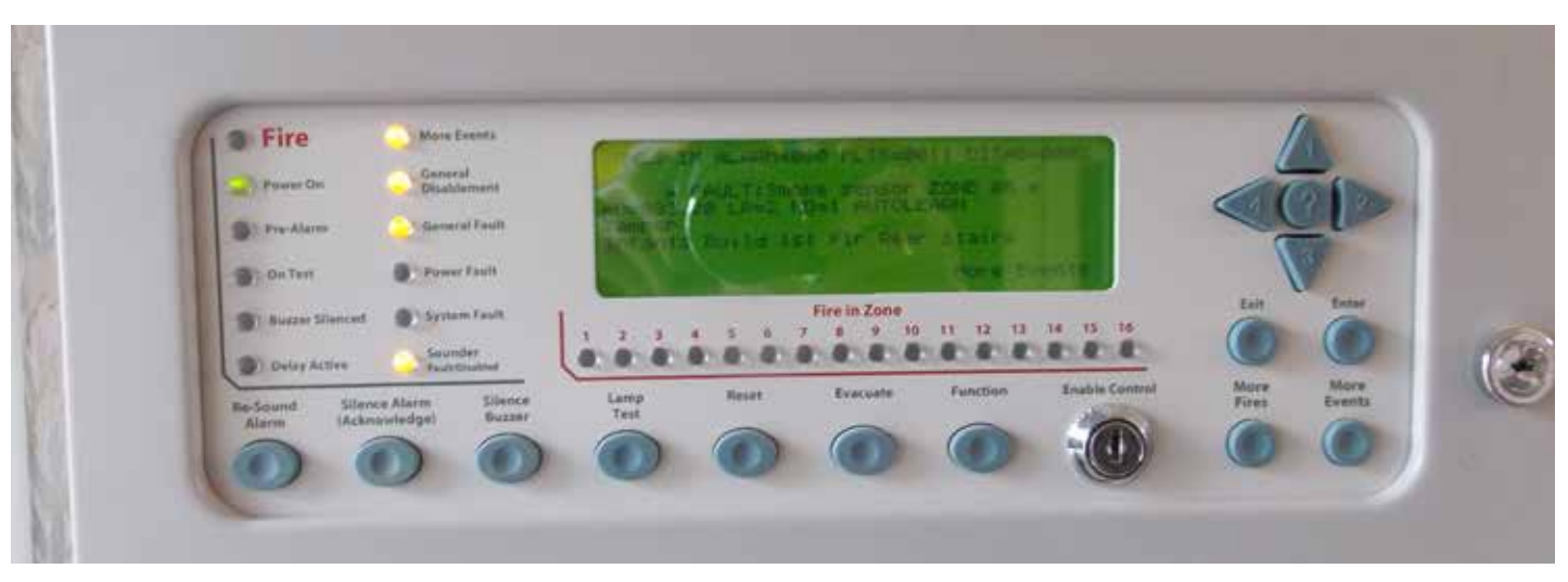
Figure 15: Example of panel in fault and isolate condition