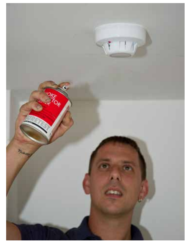
Figure 11 Weekly test of fire detection system

Fixing the issues surrounding MCPs and false signals generated from ARCs would lead to the reduction of false alarms by approximately 20% (this estimate comes from both this and the previous BRE false alarm study).