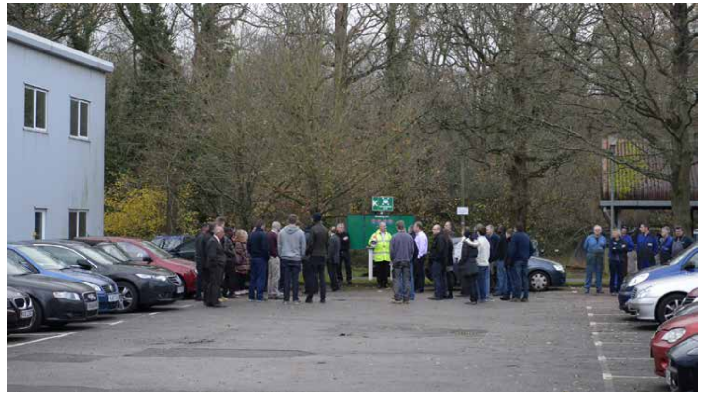
Figure 1: Business disruption during a false alarm

Following a multi-agency briefing to the Scottish Fire and Rescue Service Board a more thorough investigation of false fire alarm causes was proposed, leading to this research work which has been carried out by BRE in conjunction with the SFRS and with the support of a number of stakeholders.