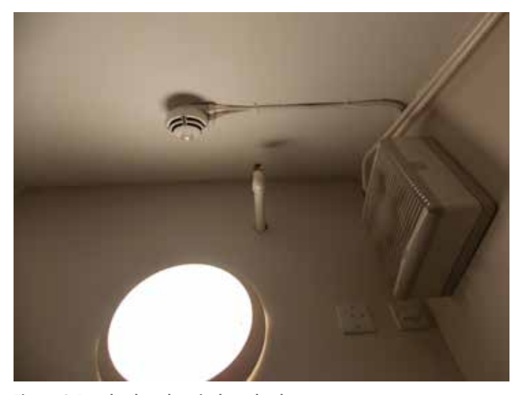
Figure 6: Poorly placed optical smoke detector

False alarms were not observed from aspirating smoke detectors, but there was one anecdotal account of activation from aerosol spray. A greater sample size would be required to identify more accurately the proportion of false alarms generated by the other less frequent offenders, such as linear heat detectors, ionisation smoke, carbon monoxide and optical beam smoke detectors. When reporting false alarms using the IRS, no distinction is made between optical point smoke, optical beam and aspirating smoke detectors which are classified under the generic heading "smoke detectors".