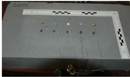
Figure 5 – Fixings installed in concrete block with weights attached

Table 2 provides details of the fixings which were used for these experiments. BRE Global notes that most commercially available fixings for masonry or concrete substrates are medium to heavy duty fixings with a minimum diameter of 6 mm and as such may not be suitable for use with all cable supports. However, fixings of the smallest available diameter (6mm) were used since it is assumed here that the diameter of the fixing should not impact on its performance if it was reduced to 4 mm.