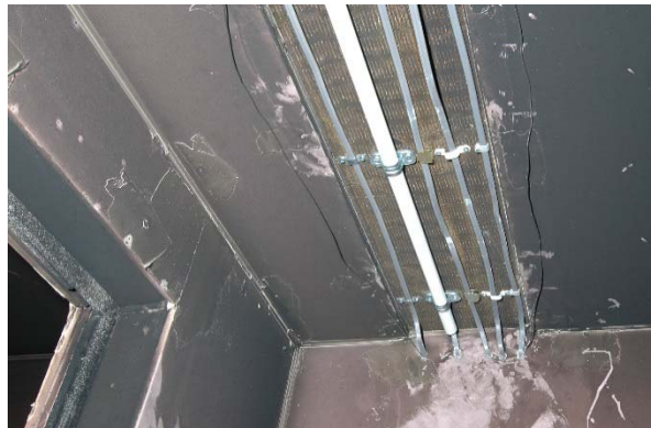
Figure 3 - Close up of cable set fixed to a timber sleeper with the selection of cable supports prior to an experiment