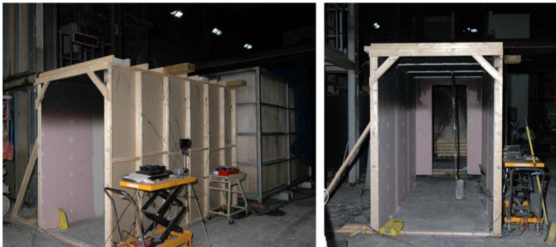
Figure 2 – Images of experimental rig

Four sets of five cables, supported with a selection of cable supports, were installed horizontally across the width of the corridor. The cables and supports were fixed to different structure types; timber sleepers and concrete lintels, which were placed alternately, approximately one metre apart along the corridor (see