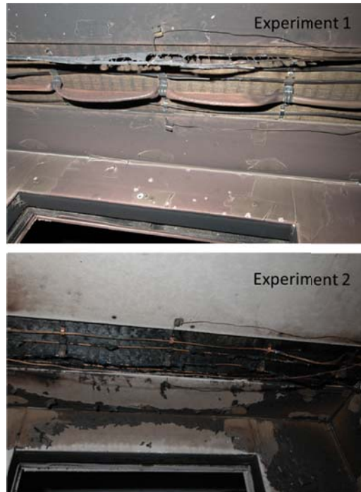
Figure 6 - Comparison of the condition of cables and cable supports after the experiments (In both images the plastic clips have failed but the metal supports are intact)