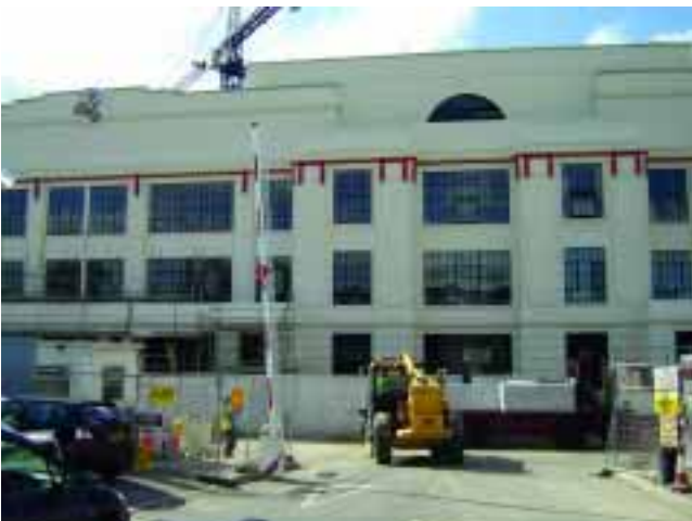
Figure 1.1 Façade retention for new apartment development

Recently, piles have been re-engineered and successfully reused on infrastructure projects, for example railway