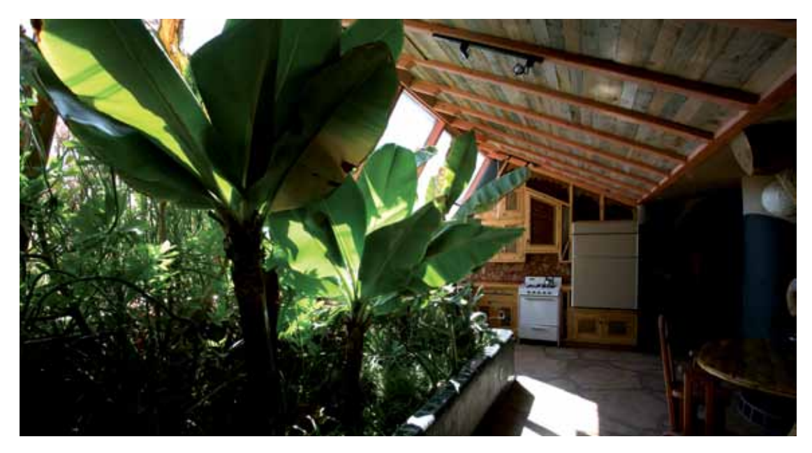
Figure 1: Hut House kitchen (Taos, New Mexico) with bananas growing in greywater planter

The prophecy that earthships would not become an integral part of plans for sustainable housing has so far been fulfilled. A small number of earthships, though, have been successfully completed across Europe. And it is these European builds that form the focus of this book – they essentially remain prototypes of a building approach that was first developed in the arid, high-altitude desert of New Mexico, and has now been translated to a variety